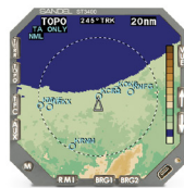
ST3400 3-ATI TAWS/RMI