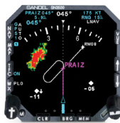
SN3500 3-ATI Electronic HSI