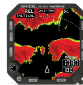
ST3453H MIL-STD HeliTAWS®