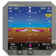
SA4550 4-ATI Primary Attitude