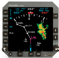
SN4500 4-ATI Primary Navigation