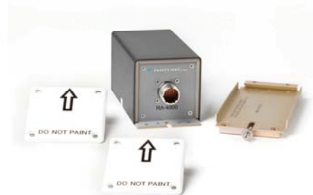
FreeFlight Systems RA-4000 and RA-4500 TSO-Certified Radar Altimeters