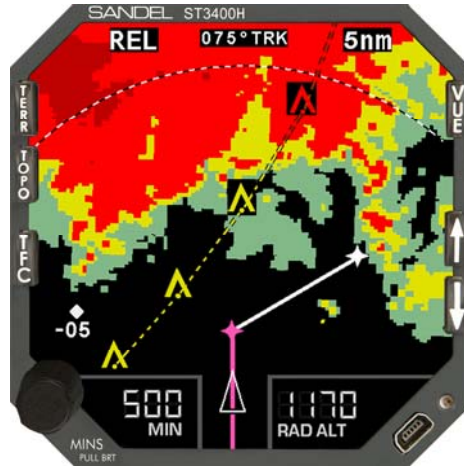
Sandel Avionics ST3400H HTAWS

3700 Interstate 35 South Waco, TX 76706-3756 USA